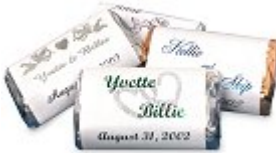
Personalized mini chocolates