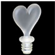
Personalized bottle stopper

All you have to do is think about how you would like to say thanks, and what you can afford to do. Here are some visual pictures to help your with your creative ideas.